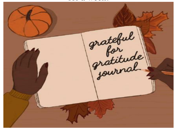
Bring your list to Mass next week to be placed on the altar to be blessed.

Practice gratitude. Get out a piece of paper. Write down everything for which you are thankful. Try to add a few more things to the list every day for a week!